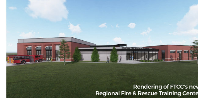
Rendering of FTCC's new Regional Fire &amp; Rescue Training Center

He said FTCC is honored to be able to serve firefighters and other emergency personnel. "FTCC is thrilled to be able to provide training in this state-of-the-art Center for the courageous men and women who step up through their professional calling to serve the emergency needs of citizens throughout