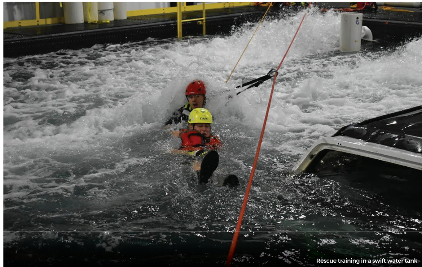
Rescue training in a swift water tank