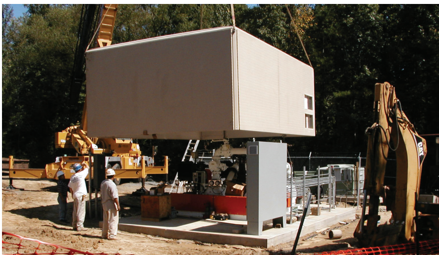
Installation of a municipal wastewater pumping station.

5400 TRINITY ROAD, SUITE 309 | RALEIGH, NC 27607 | 919-781-9310 | GOLDENCORRAL.COM