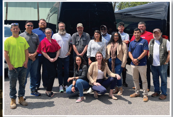
The New Bern office team (above) and a recent commercial project, Cone Health MedCenter Greensboro at Drawbridge Parkway.